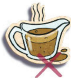
Stocks and sauces