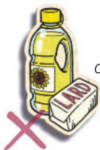
Oil and Lard